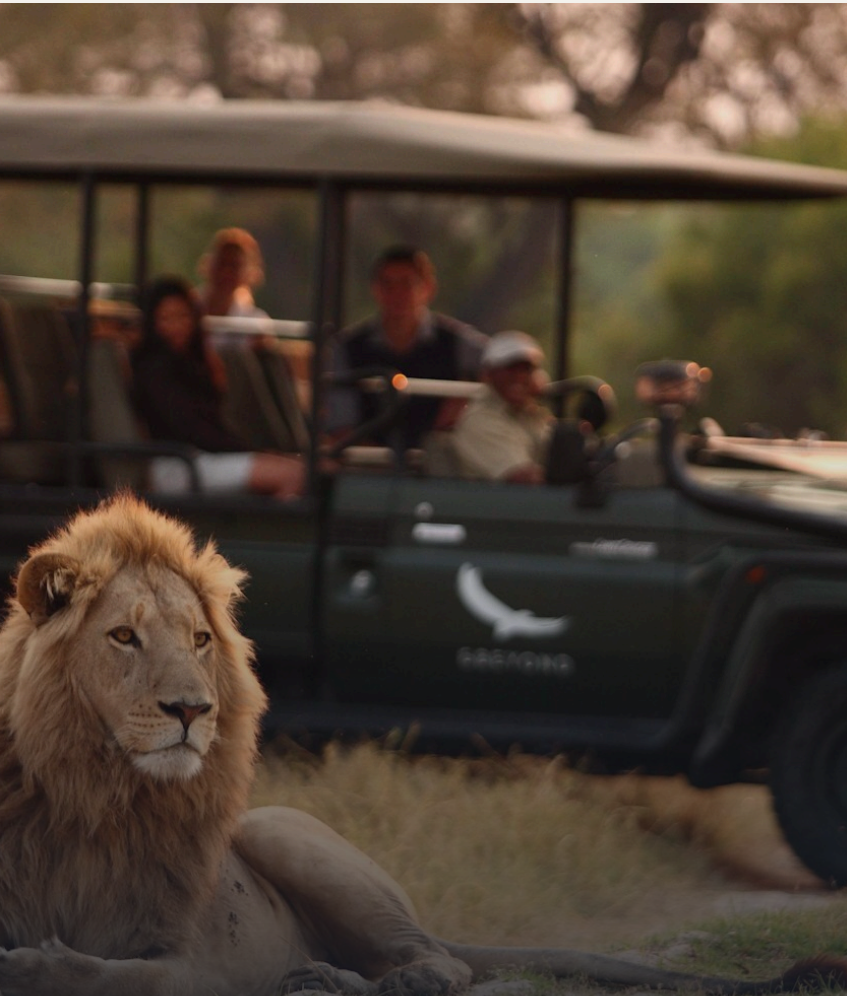
BIG FIVE SAFARI Photographic game drives

The Eastern Cape opens onto far more than the hunt. A few of our favorites are below — the full list of day trips is at johnxsafaris.com/day-trip-options .