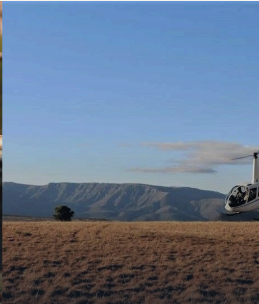
BY AIR Scenic flights & transfers